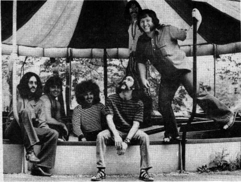
Charade - some wanted to and some didn't

Buddy told me one night after a gig, "When we got together, we sat down and talked about what we wanted Rainbow to be.