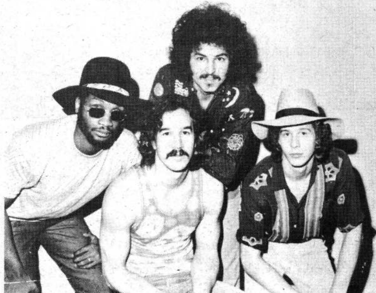
Mushroom - nobody wanted to hear

In the end, what makes the difference when a band tries to step beyond the local club circuit, is what's underneath the cover versions, whether faithful or original, of "Free" and "Them Changes" and "Moonage Daydream". And it seems eminently clear that the various backgrounds of Rainbow's members and their strong self-direction makes them one of the more likely candidates to help put Cleveland on the music map.